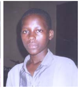
INDIA Her arm and leg healed