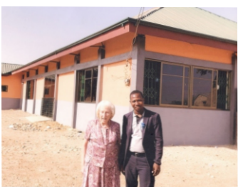
GHANA New church at Kolbeo