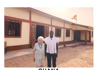
GHANA New church at Bimbagu