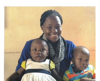
KENYA God gave her twins